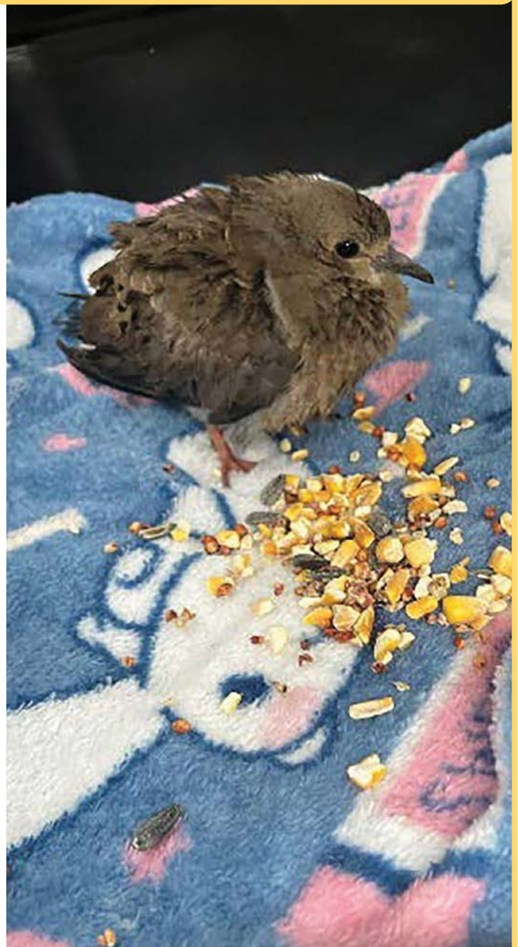
Photo of the fledgling mourning dove.

We hope that you make use of these sounds if you ever find a fledgling. Of course, you'll have to know the species, and a way to find that is by downloading the "Merlin Bird ID" app. It's chock full of great features.