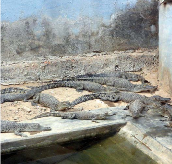
Baby saltwater crocodiles in the hatchery

I recently experienced this firsthand when I got on board the Antara River Cruises' plush catamaran.