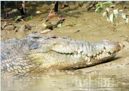
A close-up of a saltwater crocodile | Photo © Bindu Gopal Roa

Captive breeding-led crocodile conservation has boosted the population of estuarine crocodiles that was on the brink of extinction during the 1970s to a healthy 1858 today.